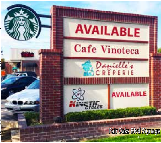
Fair Oaks Blvd Signage